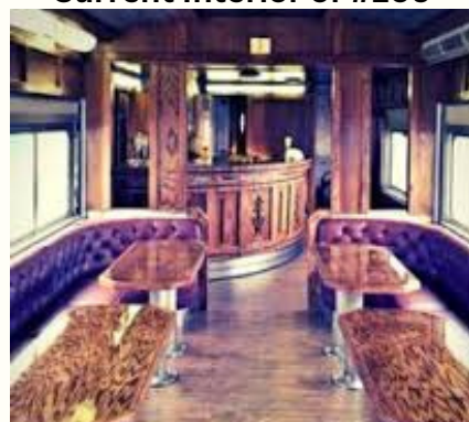
Current Interior of #109