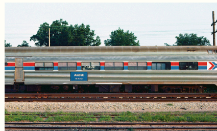
Car #109 as Amtrak 8322

A&M Railroad acquired the car in 2014 and completely refurbished it to what it looks like today. The car remains in its Coffee Shop-Lounge configuration. A few of the changes that were made include a wallpaper of an A&M train in the hallway alongside the kitchen and wooden detailing in the passenger area.