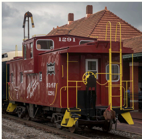
EXETER #1291